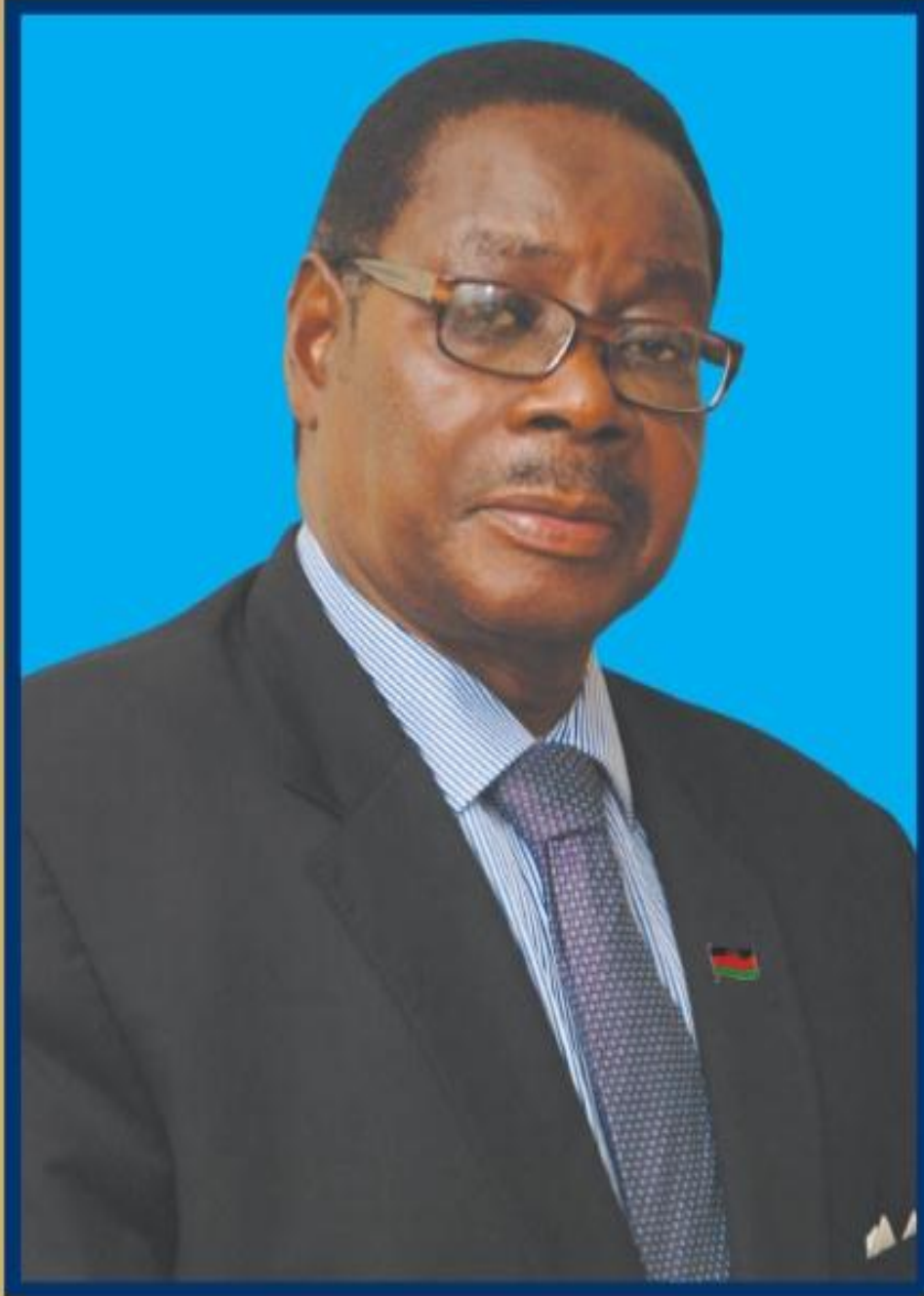
HIS EXCELLENCY PROF. ARTHUR PETER MUTHARIKA PRESIDENT OF THE REPUBLIC OF MALAWI